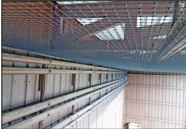
This is the story of a bird infested truck dock, exasperated owner, skilled installers and Nixalite's premier bird exclusion netting.

Product: Nixalite's K-Net HT Bird Netting