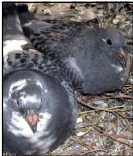
A pigeon can generate 25 lbs of droppings per year. If you multiply that by 20 - 30 birds in an average flock, things can get ugly quick.

Pest birds were landing, roosting and nesting in the structural framing, pipes and electrical service boxes all protected by the overhead canopy roof. Long term infestation had taken a toll; the surfaces under the canopy roof were heavily contaminated with ugly, corrosive and toxic bird droppings and debris.