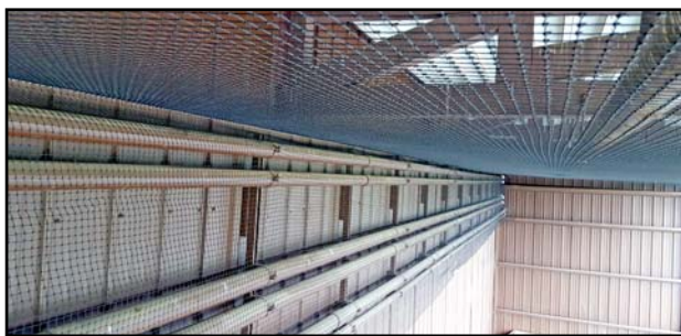
The netting was run several feet down the back wall to enclose the electrical conduit that birds were using as staging perches

For most of the installation, the bird netting and tensioned cable system would be installed just below the lowest horizontal framing of the canopy. Installing the netting across the bottom of the framing sealed off the majority of landing, roosting and nesting areas under the canopy roof. This job had a unique facet in that for several feet down the rear wall, there were bundles of electrical conduit and junction boxes that the birds had colonized as well.